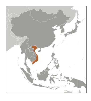
1998 July Griffis Art Center's International Artist-inResidence from Ho Chi Minh City, Socialist Republic of Vietnam (Former

INTERNATIONAL ARTIST-in-RESIDENCE PROGRAM – MAISON des ARTISTES NEW LONDON, CONNECTICUT USA